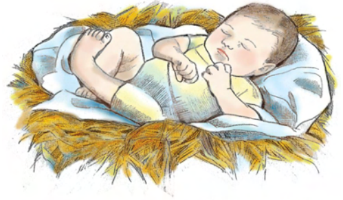
Luke 2:12, NRSV

"This will be a sign for you: you will find a child wrapped in bands of cloth and lying in a manger."